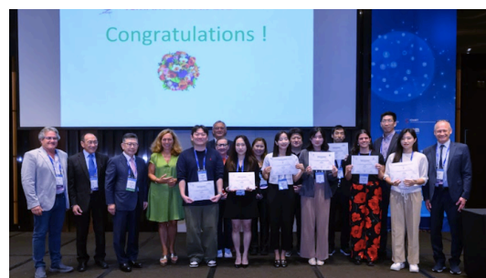
From ICMART 2024 in Jeju, South Korea

The ICMART Young Scientists Award is to encourage young researchers of promise on whom the progress in the field of acupuncture, TCM and related techniques depends. It recognizes four science projects addressing any topic related to acupuncture, TCM or related techniques – whether it is etiology, pathophysiology, diagnosis or therapy of symptoms or diseases. All submitted abstracts compete for a limited number of 4 Young Scientists Awards. Physicians, scientists, medical students and other healthcare providers currently in residency or fellowship programs of no more than three years after obtaining their final degree are eligible for application. Interested candidates should submit an abstract summarizing their research project. In addition, applicants are required to upload a brief curriculum vitae of the nominated authors and a one-page statement in plain English for the general audience describing why this scientific work should be awarded.