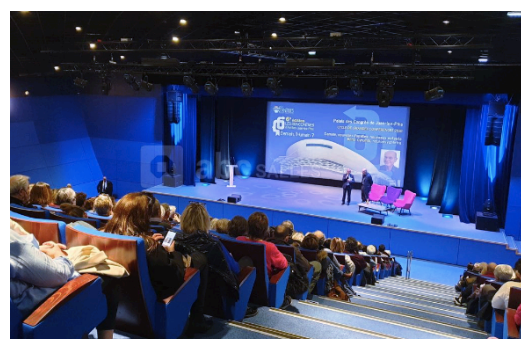
Palais des Congrès Antibes-Juan Les Pins

Poster Awards : All posters accepted for presentation by the scientific committee of the congress will take part in the competition. Poster awards will be presented during the Poster Session, where awardees will be asked to give a 10 minutes presentation of their paper. In case of absence the respective award will not be attributed. Each of the four ICMART poster awards is valued at 250 Euro.